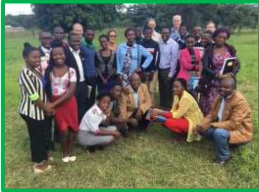
2019 students with some visitors