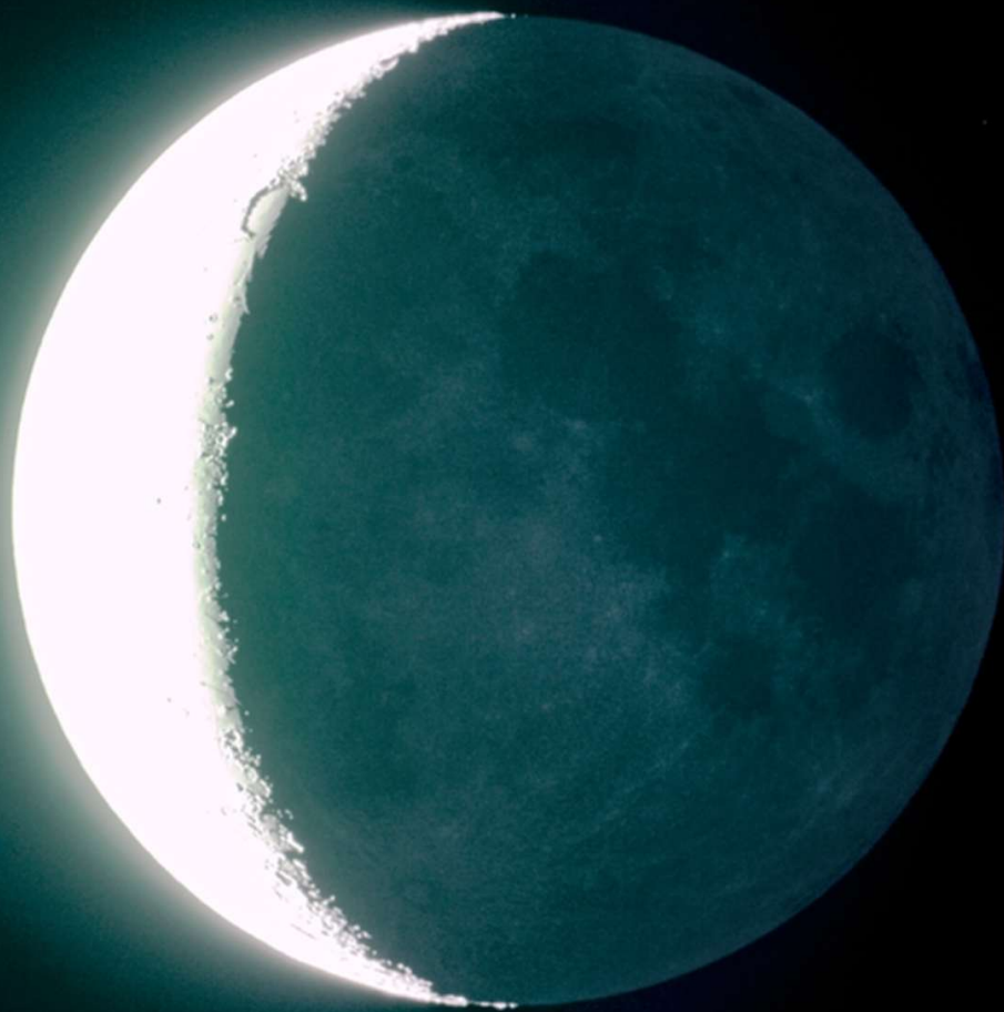
Sun-lit Waning Crescent Moon & Earth-lit (reflected Sunlight) Waxing Gibbous Earthshine